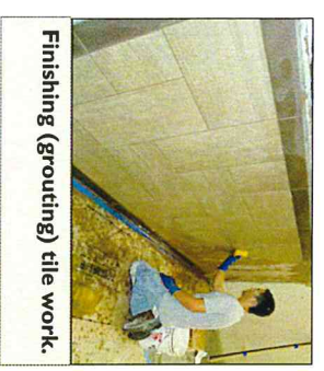
Finishing (grouting) tile work.

Tile Finishers work together with Tile Layers to create installations of ceramic, glass or stone tile. The Finisher does most of the setting up of materials at the job and clean up before & after. They mix all mortars, by machine or by hand mixing.