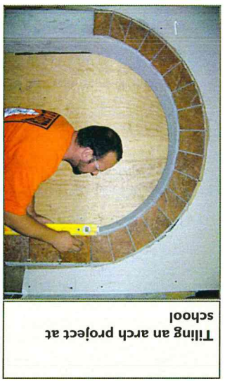
Tiling an arch project at school

Tile Layers, also called Tile Setters, install glass, ceramic or stone tile that you see in showers, tubs, kitchen countertops, floors, stairs, building exteriors and many other areas. Many times they install a thick mortar base of sand, cement and lime to create a flat or curved surface for the tile installation. They may work in a new housing, in occupied homes, or on large commercial projects, malls, schools or hospitals. Work is both indoors and outdoors and at times may involve working off of scaffolding.